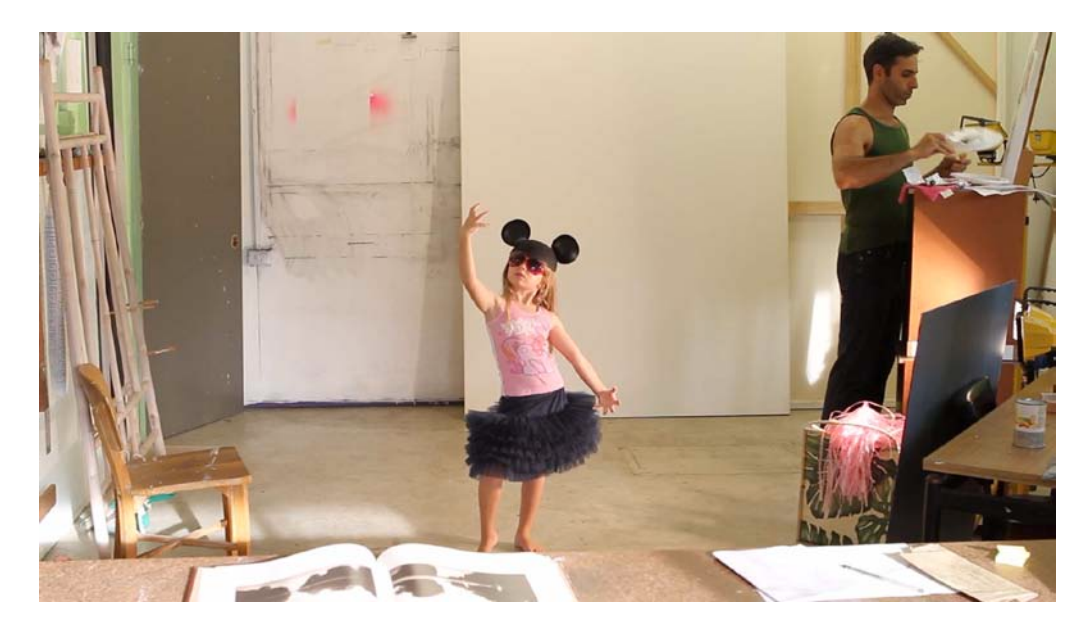
We dance in the studio (to that s... on the radio) 2010 digital video on DVD 5 minutes Collection of the artist