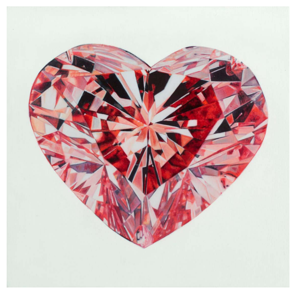
Red Diamond/First you make your heart a stone 2007 oil on board 15 x 15cm Private Collection

If one were to hold a mirror up to a mirror, one might see eternity and hear the echo of timelessness, like the static encountered when searching for a radio station echoes the universe imploding millennia ago. In the work of Michael Zavros, collected reflectively in The Glass , the mirror reoccurs as a visual and metaphoric trope, a device through which we may literally view the artist's work as either a narcissistic folly or a serious meditation on self-criticism.