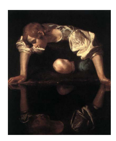
Caravaggio b. 1571-d. 1610 Narcissus 1598-99 oil on canvas 110 x 92 cm Galleria Nazionale d'Arte Antica, Rome