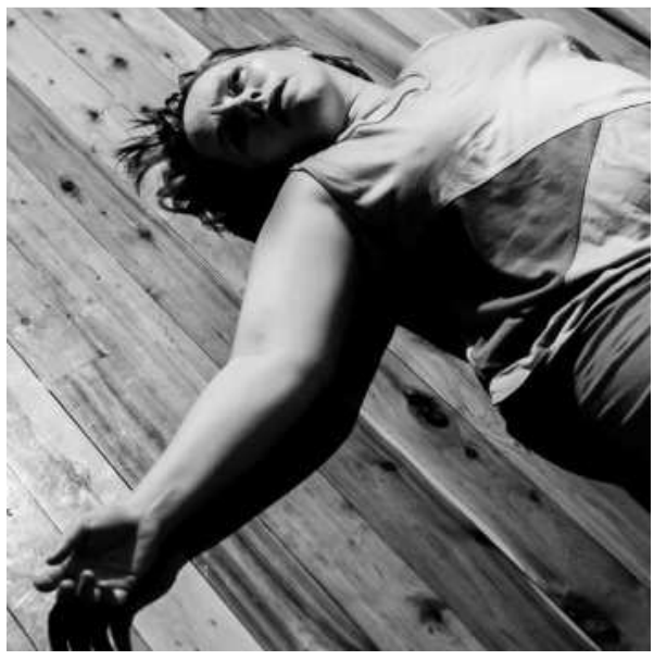
(above) Amara 2015 digital print 72 x 72cm approx. by Elise Searson of Brisbane