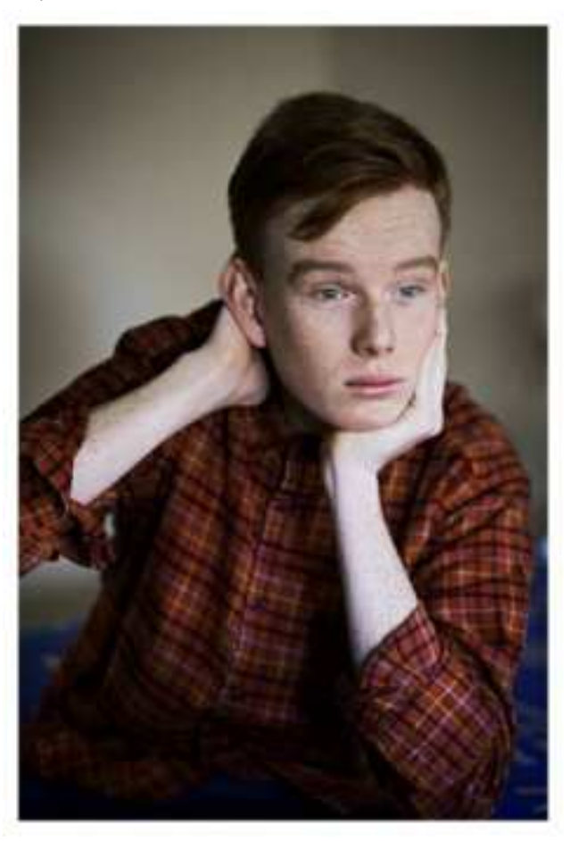
(left) Estella 2014 pigment print 80 x 60cm approx. by Hilary Walker of Melbourne