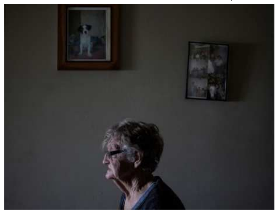
The killing of Miller's Point (Pat and Brandy) 2015 digital print 100 x 130cm approx. by Sahlan Hayes of Kangaloon and Sydney