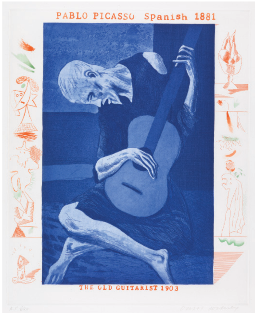
David Hockney The Old Guitarist from The Blue Guitar 1976 – 1977 Etching Edition of 200 20¾ x 18” © David Hockney