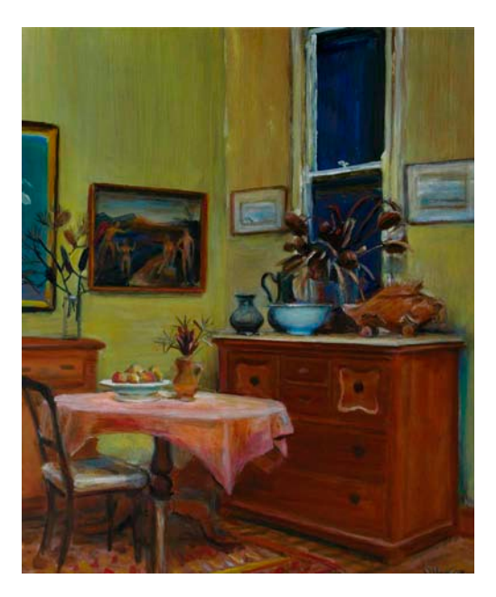
Interior night 1972 oil on composition board 59.0 x 49.0cm Collection of The University of Queensland Gift of Mrs Brenda Hughes through the Australian Government's Cultural Gifts Program, 2004 The University of Queensland Art Museum

In Kitchen still life with fennel , 1975, and Interior night , 1972, objects are arranged in front of a dark window. "This reverses the traditional depiction of light shining through a window and heightens the viewer's perception of the actual objects and their special relationships". <sup>3</sup>