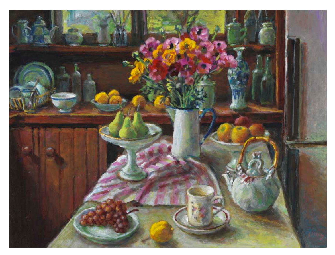
Ranunculus and pears 2004 oil on hardboard 76.0 x 101.0cm Art Gallery of New South Wales Edward Stinson Bequest Fund 2005

Ranunculus and pears was painted at Margaret's home in Duxford St Paddington, Sydney, where she lived for over 20 years. This painting depicts a corner of the kitchen in the old Hat Factory section of her Duxford St property that Margaret renovated and moved into in 1988. The window in the kitchen was south facing and looked out into the courtyard garden. In this painting Margaret has extended her still life composition with the use of space and perspective to include the cupboard benches, sink, bottles, china, fridge and window.