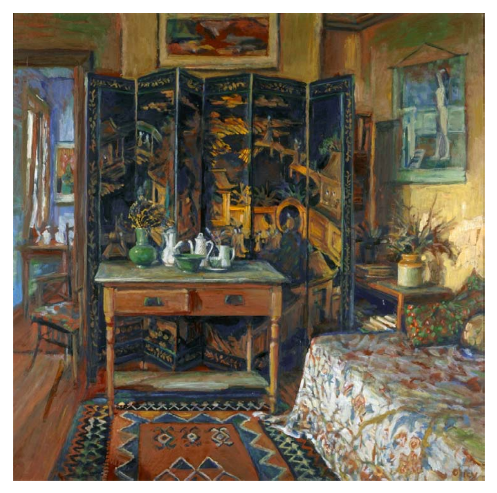
Chinese screen and vellow room 1996 oil on hardboard 75.0 x 75.0cm Art Gallery of New South Wales Purchased 1996

Chinese screen and yellow room, 1996, depicts an ornately carved oriental screen that acts as a backdrop to a simple arrangement of white and green glazed ceramics, with a bunch of native dried flowers, in one of Margaret's favorite rooms, known as the Yellow Room, in her Duxford St home.