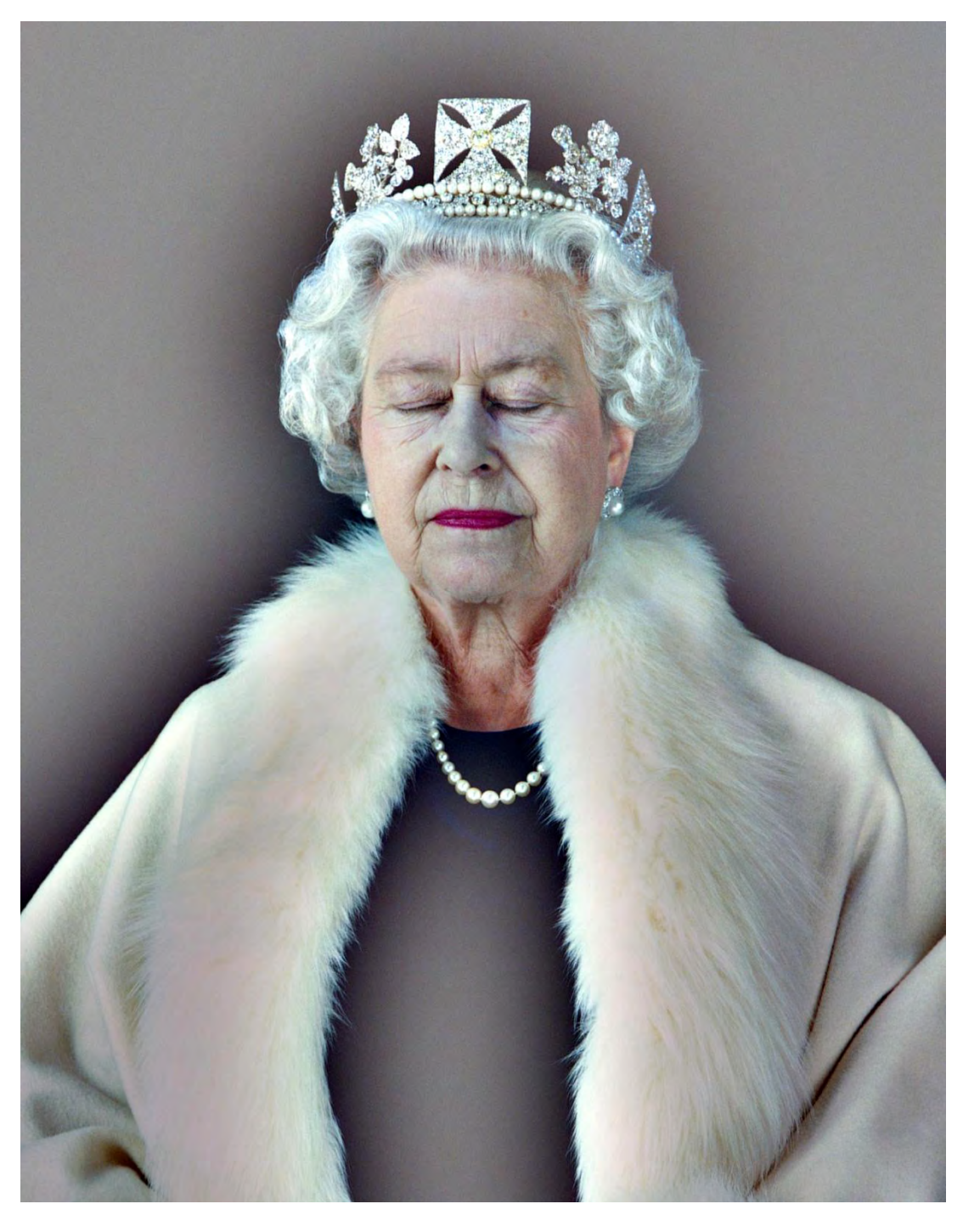
Chris LEVINE Lightness of Being 2007 giclee print 37.5 x 48cm