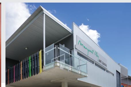
Margaret Olley Art Centre