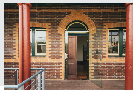
Tweed Regional Museum, Murwillumbah