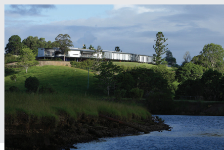
Tweed Regional Gallery & Margaret Olley Art Centre